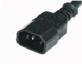
IEC320 C14 10A plug